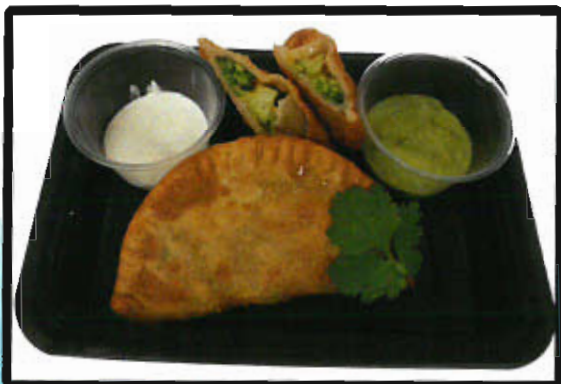
EMPANADA BROCCOLI & CHEDDAR EBC1009BCP