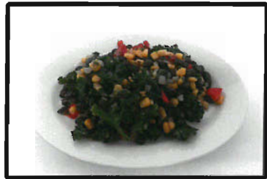
SOUTHWEST KALE SALAD CCS-0001-SWK