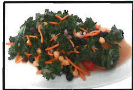
SUPER FOODS SALAD RASPBERRY VINAIGRETTE CCS-0401-SF