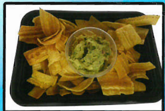
FRIED PLANTAINS & GUACAMOLE PCG1011CBP