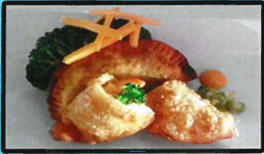
LOBSTER-BROCCOLI & CHEDDAR EMPANADA UNCOOKED - CE 1001LBCU PARCOOKED - CE 1001LBCC