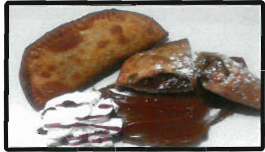
DULCE DE LECHE EMPANADA

UNCOOKED - CE1021RPU PARCOOKED - 1021RPC