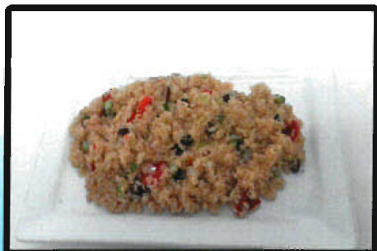
QUINOA SALAD RED WINE VINAIGRETTE CCS-0301-QS