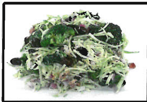
BROCCOLI CRUNCH SLAW CCS-0101-BCS