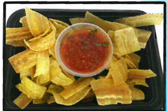
FRIED PLANTAINS & SALSA PCS1011CBP