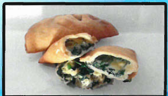
SPINACH & CHEESE EMPANADA UNCOOKED - CE 1012SCU PARCOOKED - CE 1012SCC