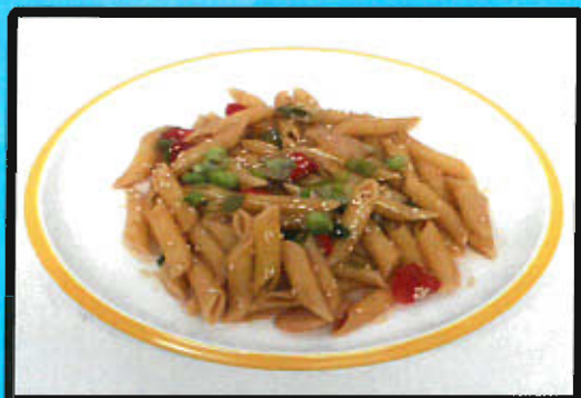
ASIAN SESAME NOODLE SALAD HOI SIN SAUCE CCS-0201-ASN