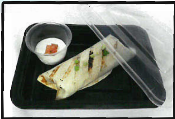
BEAN BURRITO BB1008CBP