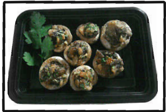
STUFFED MUSHROOMS SM1010MFGP