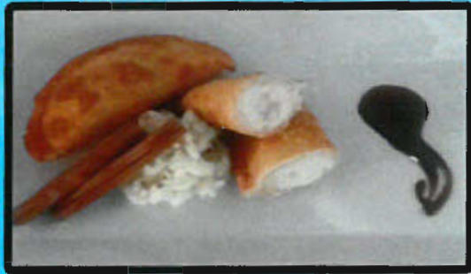
CUBAN RICE PUDDING EMPANADA

UNCOOKED - CE1021RPU PARCOOKED - 1021RPC