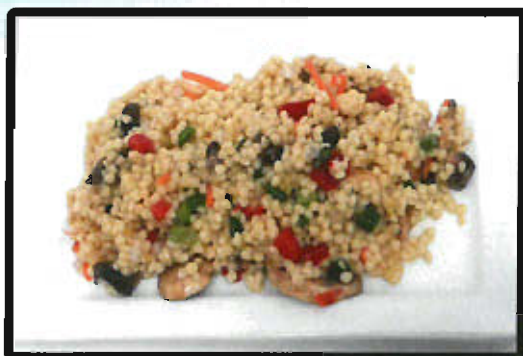
MEDITERRANEAN COUS COUS CHICK PEA SALAD LEMON VINAIGRETTE CCS-5001-MCPS