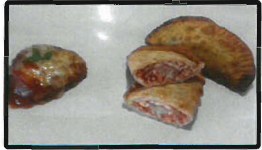
EGGPLANT PARMESEAN EMPANADA UNCOOKED - CE 1015EPU PARCOOKED - CE 1015EPC