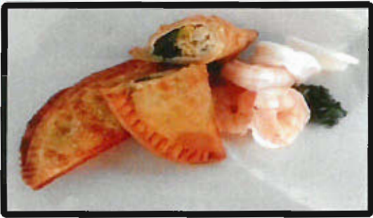
SEAFOOD & SWEET CORN EMPANADA