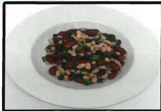
SPICY 3 BEAN SALAD WHITE BALSAMIC VINAIGRETTE CCS-7001-3B