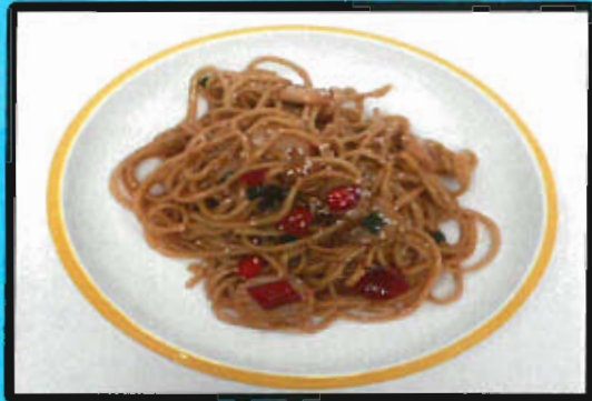
ASIAN SESAME LOMEIN SALAD HOI SIN DRESSING CCS-1001-ASL