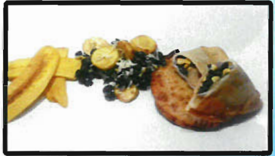
CUBANO EMPANADA UNCOOKED - CE 1009PBCU PARCOOKED - CE 1009PBCC