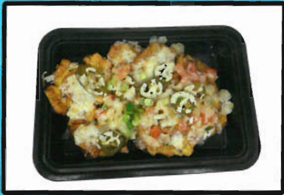
TOSTONES NACHOS TN1007CBP