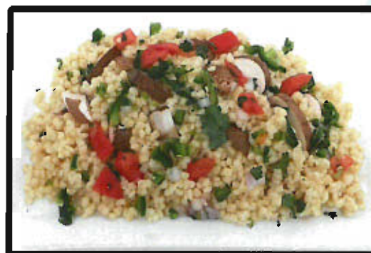
BARLEY MUSHROOM SALAD WHITE BALSAMIC DRESSING CCS-2001-BMS