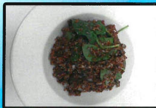
RED QUINOA AND BABY SPINACH RED WINE VINAIGRETTE CCS-6002-RQBS