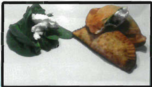
SPINACH & GOAT CHEESE EMPANADA UNCOOKED - CE 1011SGU PARCOOKED - CE 1011SGC