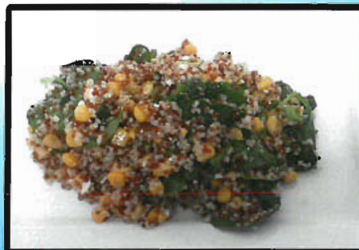
TRI COLOR QUINOA SPINACH SALAD LEMON VINAIGRETTE CCS-9001-TCQS